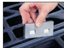
Easy-to-install Joining Clip

By joining centers together with the patented Sump-to-Sump™ Drain Kit for a total 66-gallon sump capacity, you will meet EPA and UFC requirements.