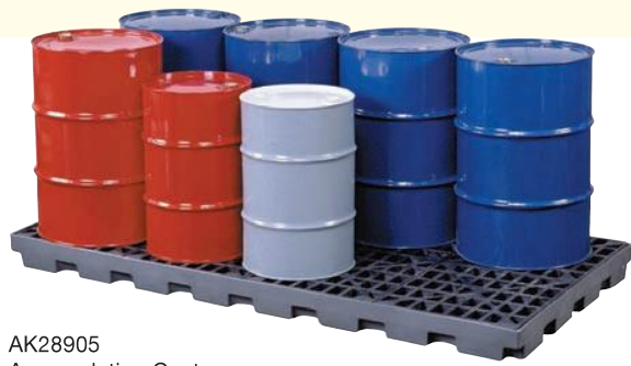
AK28905 Accumulation Center with AK28906 Ramp